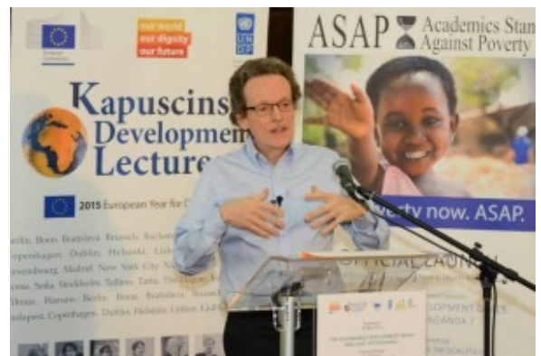
Thomas Pogge speaking at the Kapuscinsky Development Lectures, May 25th, 2015

The ASAP Romania launch was marked by the Kapuscinski Development Lecture held by Thomas Pogge , Leitner Professor of International Affairs at Yale University and President of Academics Stand Against Poverty , 'Development Goals – Brilliant Propaganda?' during which he emphasized the flaws within the Millennium Development Goals and how we should address them in the post-2015 development agenda.